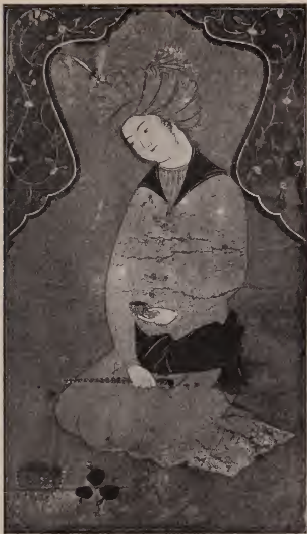
INDO-PERSIAN PICTURE (SIXTEENTH CENTURY).